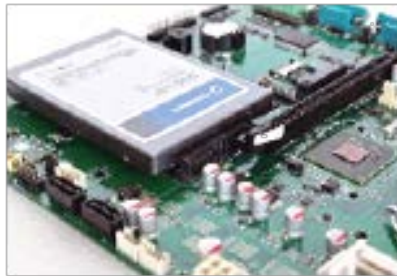
Direct HDD connection No internal cabling