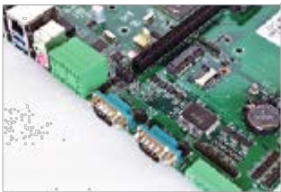
8KV ESD, TVS 600W Surge Protection for COM port